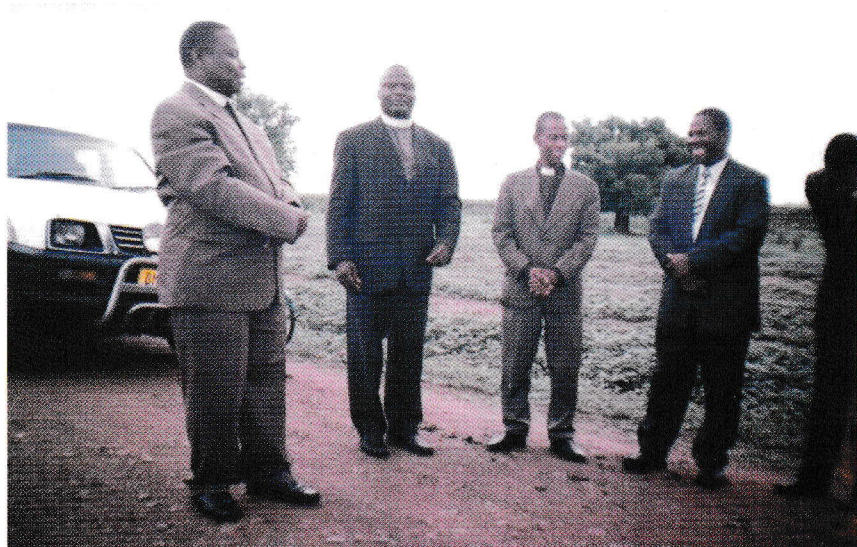
Moderator and members of the Alumenda Synod

During 2007 St. Fillan's donated a total of £2,500 to the congregation at Alumenda. The majority of this was used to purchase cement for the foundations of the new church. In addition the funds provided for some special bibles for the blind. In response to their request, we also arranged supply of 200 advice leaflets on HIV/AIDS