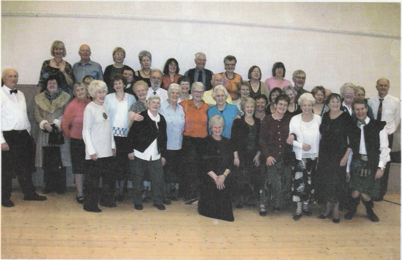
Scottish Country Dance Club Lunch Club