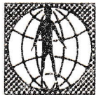
CHURCHES IN ACTION WITH THE WORLD'S POOR

The Annual Christian Aid Coffee Morning will be held on Saturday 12th May in St. Fillan's Church Hall between 10.00 a.m. and 12.00 noon. Tickets are available from Committee members or at the Hall door - 50p. Donations for bric-a-brac, books, baking, plants and gift stalls would be much appreciated.